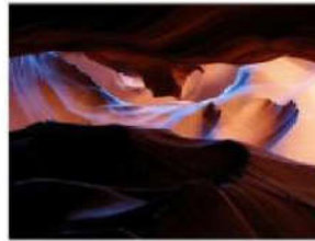
Beautiful glow inside the canyon