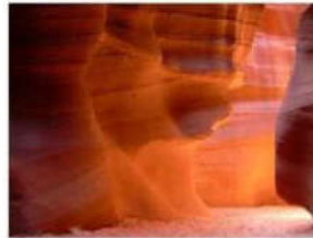
Reflective light producing orange glow inside the canyon's first room