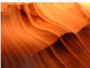
Beautiful Navajo Sandstone, great example of cross-bedding throughout the canyon

The mysterious and haunting beauty of Antelope Canyon (also known as "Corkscrew Canyon") awaits the adventurous traveler who seeks to discover one of the most spectacular, yet little known attractions of the Lake Powell area. A tour to this awe-inspiring sculpture set in stone is a must for amateur and professional photographers alike. Come see nature's surprising masterpiece of color.