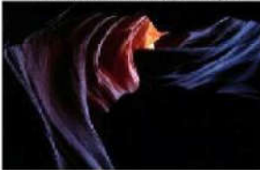
Purple and Blue colors