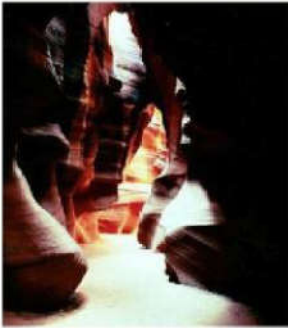
First chamber of Antelope Canyon