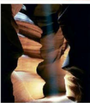
Light shaft within the canyon