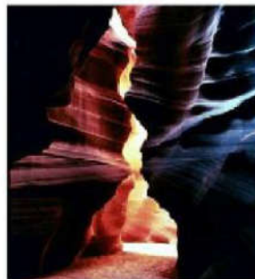
Colors vary from red, orange, purple, and blue