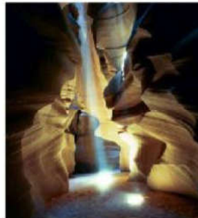
Light-shaft in second chamber